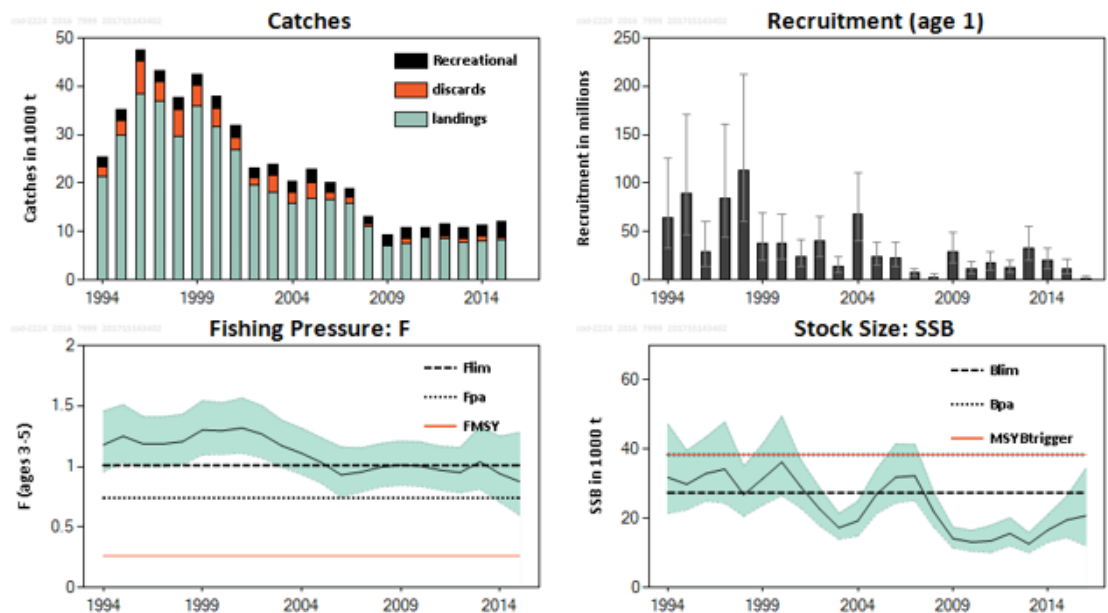
Figure 5.1.1. Cod in subdivisions 22–24 (western Baltic cod). Summary of stock assessment (weights in thousand tonnes). Recruitment, F , and SSB have confidence intervals (95%) in the plot. The EU landing obligation started in 2015; therefore, landings in 2015 include fish above and below the minimum conservation reference size (MCRS).

The 2015 ICES Benchmark Workshop on Baltic Cod Stocks evaluated the appropriateness of data and methods to determine stock status for the cod stocks in SD 22–24 (western) and SD 25–32 (eastern) (ICES, 2015b). Stock identification based on otolith shape analysis showed a high degree of stock mixing in SD 24, so the catch was split into two stocks with the eastern cod representing around 65% of the current total removals. The proportions of eastern and western cod in SD 24 was reconstructed back to the mid-1990s and landings at-age were obtained using the age structure from SD 22 (ICES, 2015b). A stochastic state–space model (SAM) is used to estimate trends and status.