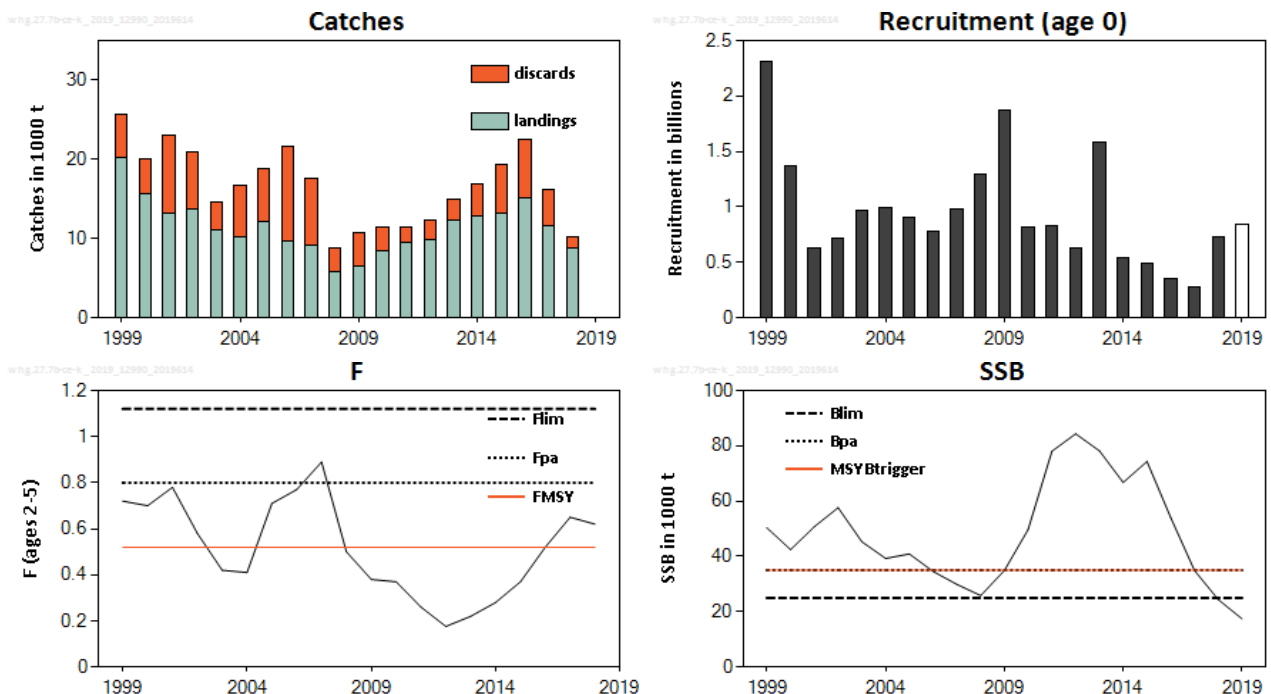
Figure 1 Whiting in divisions 7.b–c and 7.e–k. Summary of the stock assessment. The assumed recruitment value is not shaded.

The spawning-stock biomass (SSB) has decreased since 2012 and is estimated at below MSY B_{trigger} since 2017 and below B_{lim} since 2018. Fishing mortality (F) was below F_{MSY} between 2008 and 2016, but has increased above F_{MSY} since. Recruitment (R) has been below average since 2014.