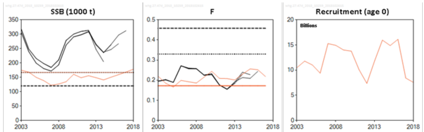
Figure 2 Whiting in Subarea 4 and Division 7.d. Historical assessment results.

There have been issues with regard to the age readings of North Sea whiting compared to other gadoids; in particular, age readings used for the IBTS indices. Age-reading techniques were reviewed and coordinated between countries in late 2016 (ICES, 2016a), and continue to be investigated. Until these investigations have been concluded, reported age readings continue to be used as in previous years.