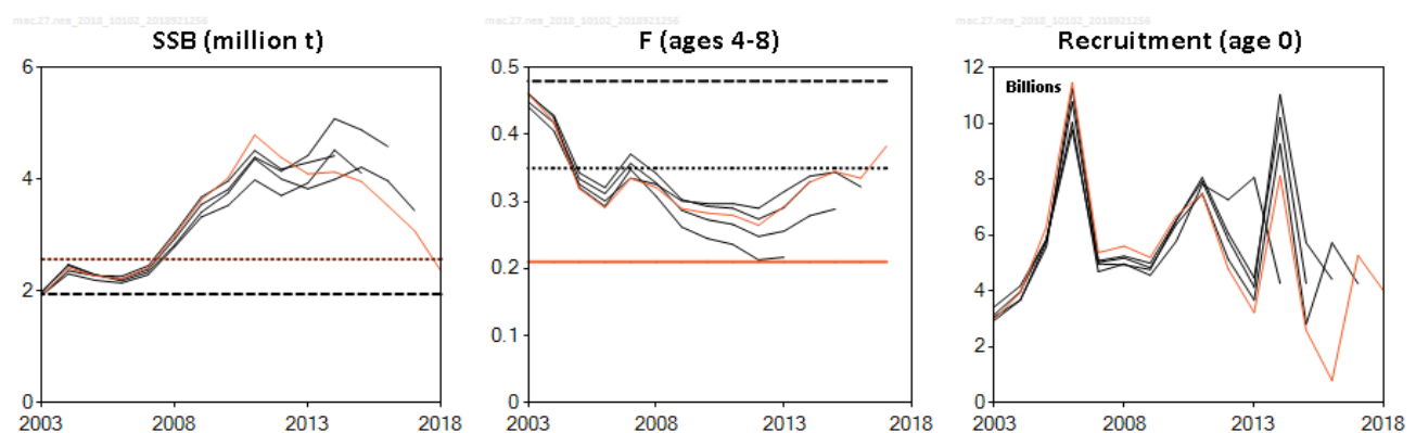
Figure 2 Mackerel in subareas 1–8 and 14, and in Division 9.a. Historical assessment results. Since the 2014 assessment, the last two years of each recruitment line are assumed values used in the forecast.

Abundance estimates of ages 0–1 are uncertain because: (1) they are not fully recruited to the fishery and are more variable in the catch-at-age data (ICES, 2017b), and (2) the IBTS recruitment index has not been updated for 2016 and 2017, though this index has had low weight in the assessment model till now. This has limited impact on the advised catch.