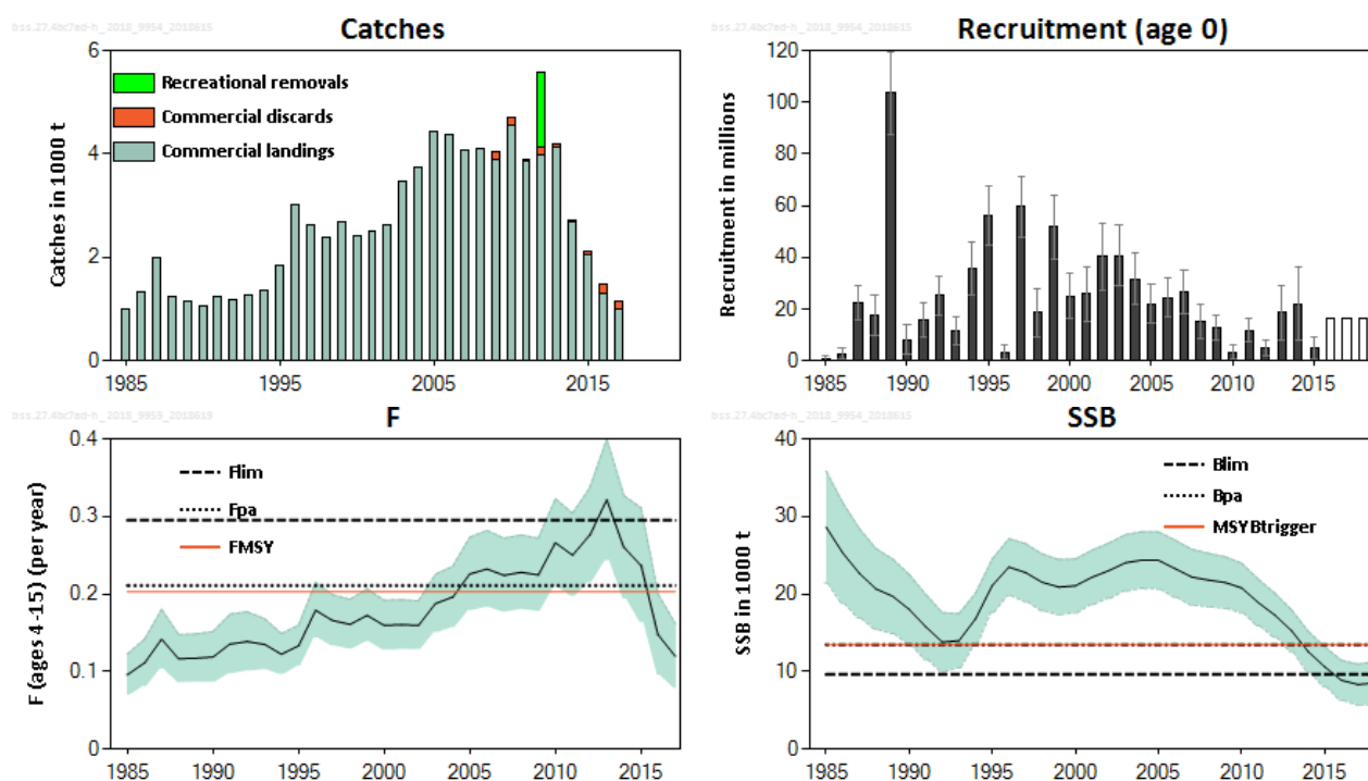
Figure 1 Seabass in divisions 4.b–c, 7.a, and 7.d–h. Summary of the stock assessment. Total landings (commercial landings and estimated recreational removals, available for 2012 only, taking mortality of released fish into account). Fishing mortality is shown for the combined commercial and recreational fisheries. Discard estimates are available since 2009. Predicted recruitment values are not shaded. Recruitment, F, and SSB are shown with 95% confidence intervals.

Spawning–stock biomass (SSB) has been declining since 2005 and is now below B_{lim} . Fishing mortality (F) has increased over the time-series, peaking in 2013 before a rapid decline to below F_{MSY} . Recruitment was estimated to be poor since 2008, with the exception of the 2013 and 2014 year-class estimates which show average recruitment.