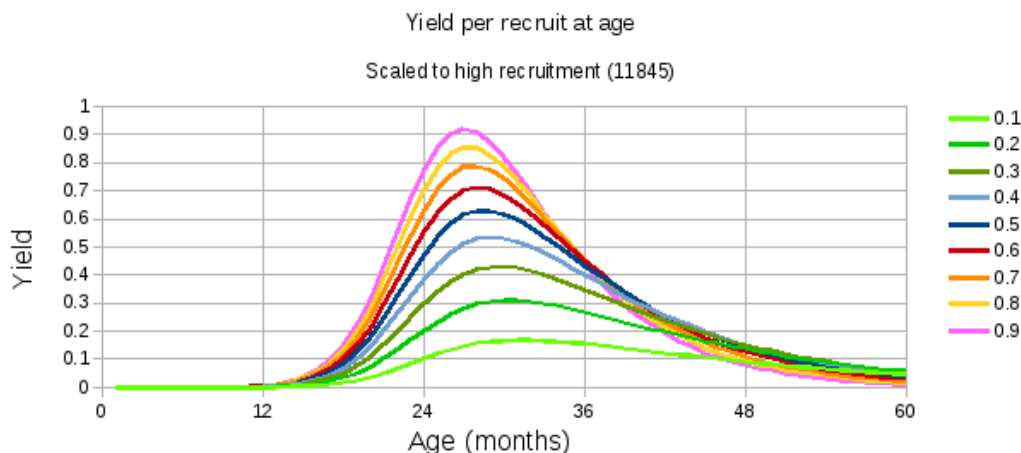
Figure 6.4.2.2 Yield-per-recruit for different ages at first capture and for a range of F (0.1–0.9).

ICES notes that an increase in the TAC following an in-year revision owing to a large incoming year class could lead to either (1) increased discarding of small shrimp and a higher F on the bigger shrimp, or (2) no change in fishing behaviour if the increased TAC is not restricting. Yield-per-recruit analyses were carried out to explore the consequences of harvesting starting at different ages at first capture (Figure 6.4.2.2). A yield-per-recruit analysis, not taking discarding into account, shows that the overall yield, at any realistic F level, is higher if the shrimp are allowed to become 2-year-olds before being fished.